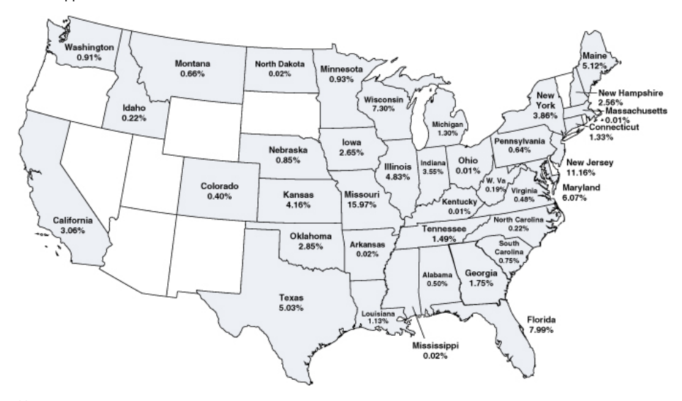
(1) The term "Bank Issuers" as used herein refers to banks or holding companies thereof and includes issuers in which we have direct and indirect investments. Includes Community Funding CLO, Ltd. <sup>(2)</sup> For purposes of this table the calculation of the percentage of total Long-Term Investments are based on the Bank Issuers in which SCFC directly and indirectly holds investments. With respect to direct investments that are secured by obligations issued by Bank Issuers (each a "Secured Bond"), the percentage was calculated by prorating the market value of the Secured Bond among the obligations issued by the underlying Bank Issuers that collateralize such Secured Bond and dividing each such amount by total Long-Term Investments.