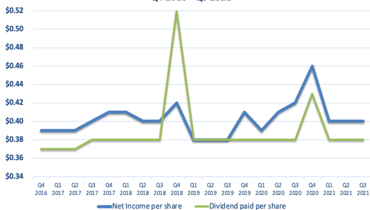
5 Years of Consistent Coverage of Dividend Q4 2016 - Q3 2021